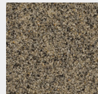
| Stone Grey |