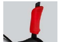
Brush Speed Adjustment