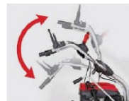
Handle Height Adjustment