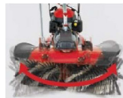
Brush Direction Adjustment