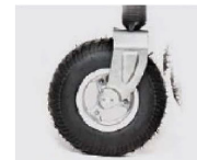
9" Support Wheel