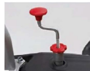
Brush Height Adjustable Lever