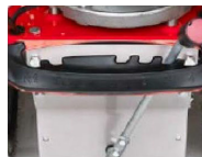
Forward Rearward Gear Operating Lever